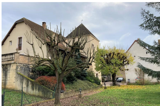
Domaine P&L Borgeot